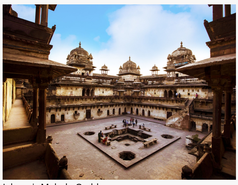
Jahangir Mahal - Orchha

Site, marking a historic milestone for both Madhya Pradesh and the country's preservation of cultural heritage.