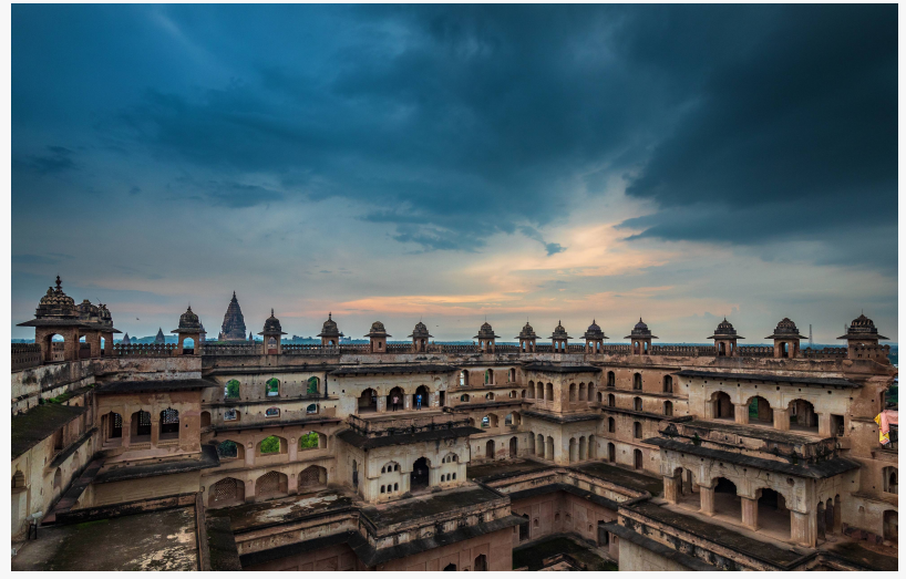
The Raja Mahal - Orchha

meticulously to prepare detailed dossiers for Orchha, Mandu, and Bhedaghat.