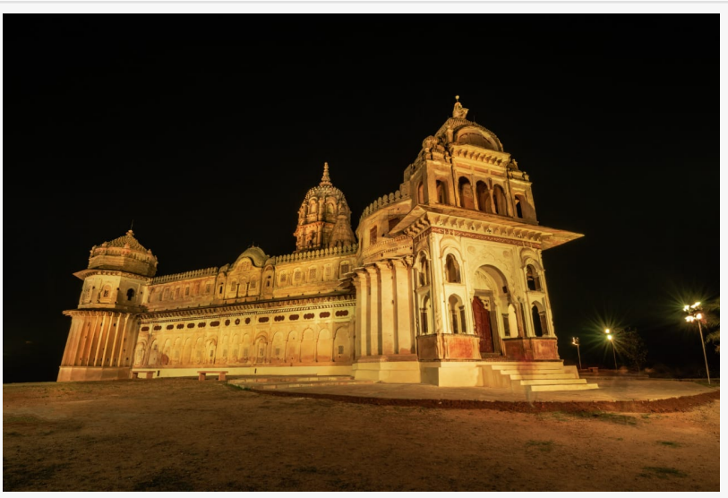
Laxmi Narayan Temple - Orchha

Madhya Pradesh, known as a state of archaeological and geological marvels, is rich in historical treasures that reflect the depth of its cultural significance. If approved by UNESCO, Orchha will become India's first state-protected site to be designated as a World Heritage