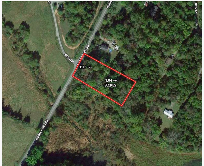
Middle River Road, Stanardsville, VA 22973

"With seasonal mountain views and a short walk to a community lake, the property is an ideal location for a dream home," said Nicholls. "Don't miss this opportunity to own or invest in property that will meet your current or future needs. Make plans now to bid and buy and make it yours."