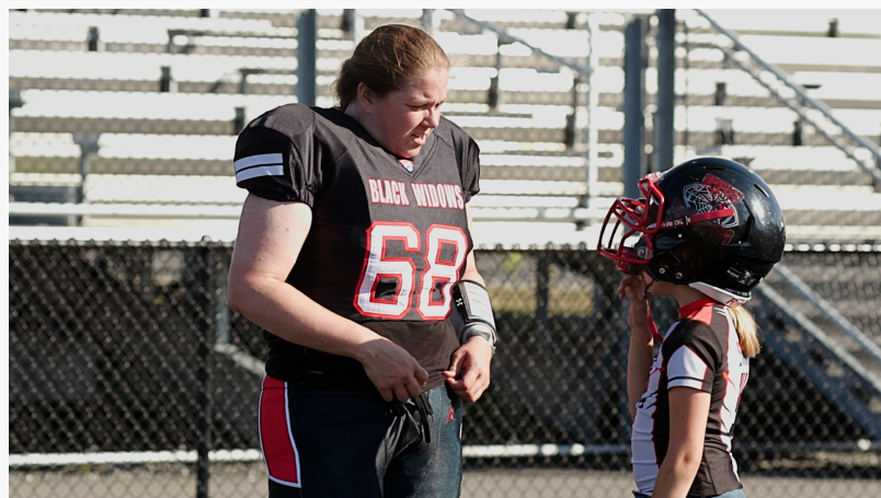
Turner speaking with her daughter during a break in football play.