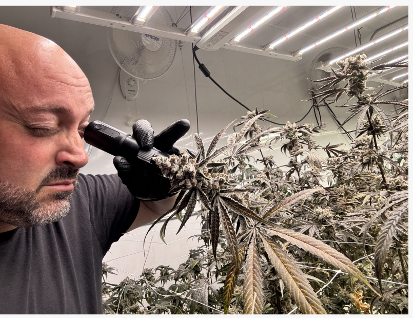
Cultivating Mississippi's finest medical cannabis with precision and care.

With the cultivation facility nearing completion, the November tour marks a significant milestone in the company's timeline. The Sweet Life Canna Co. leadership team believes that experiencing the facility firsthand will reinforce the immense potential for investors to be part of bringing this venture into full operation.