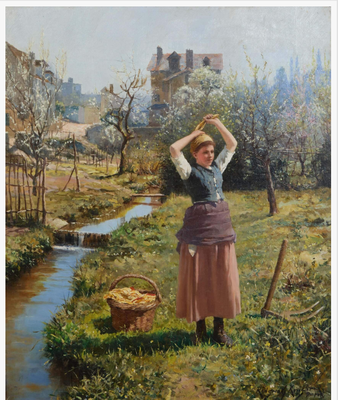
This vibrant oil on canvas painting by Daniel Ridgway Knight (American/Paris, 1839-1924), titled Lavandiere , rendered circa the 1880s, carries a pre-sale estimate of $20,000-$40,000.