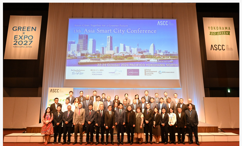
39 cities and institutions that participated in the conference expressed their support.