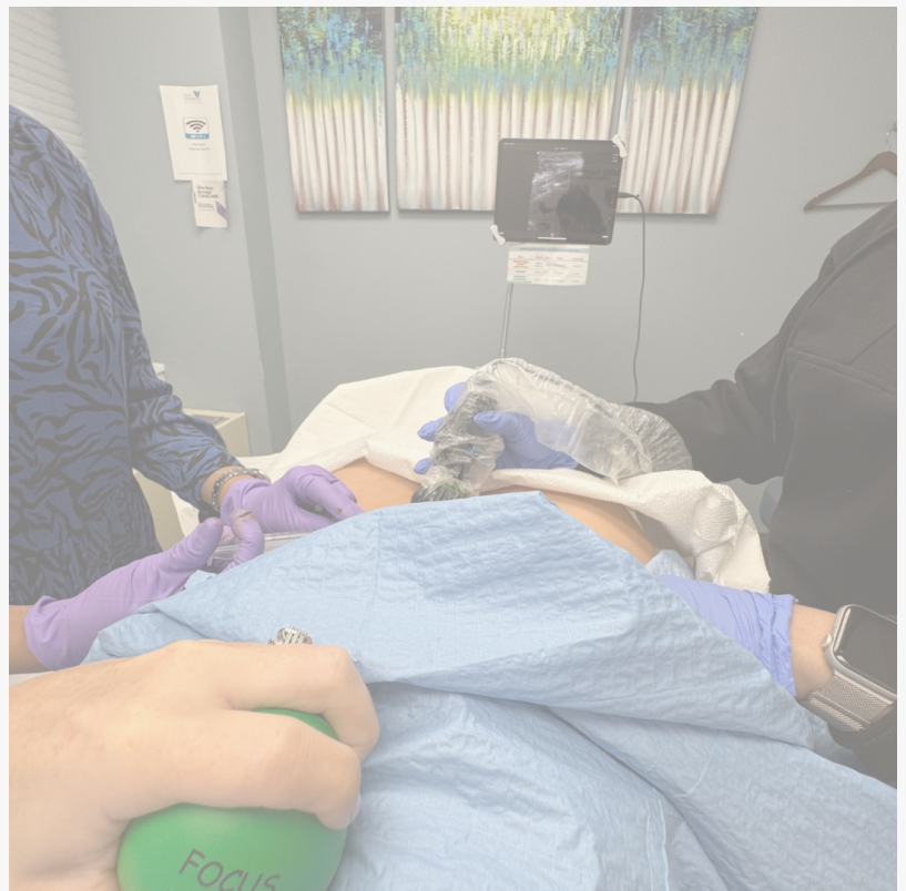
Patient undergoing PRM Protocol w ultrasound