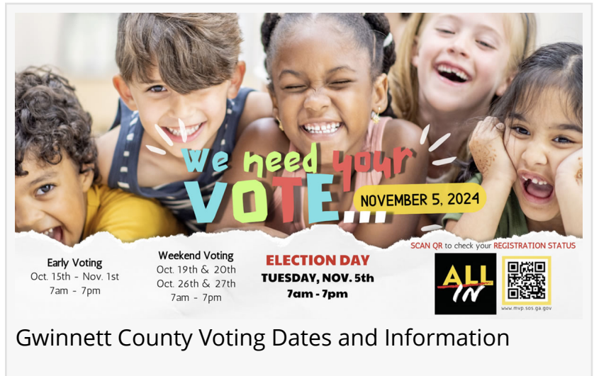
Gwinnett County Voting Dates and Information