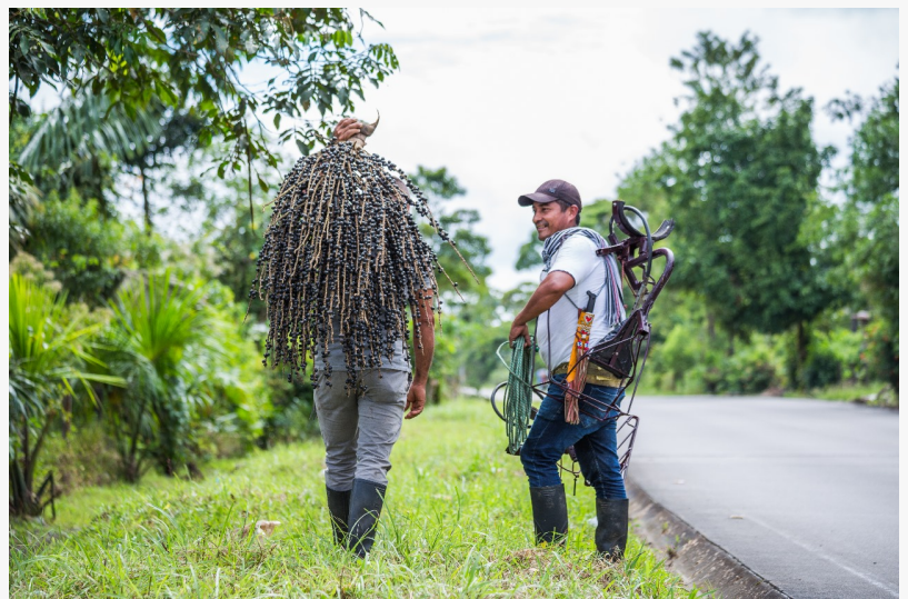
Rural producers are being encouraged to engage in açaí cultivation

With a global açaí market valued at USD 6.9 billion and projected to reach USD 14.8 billion by 2030, Colombia has the potential to become a major international player. The compound annual growth rate (CAGR) of 11.5% and the increased demand for healthy foods offer a unique opportunity for the country to capture up to 60% of this market if it expands production and invests in infrastructure.