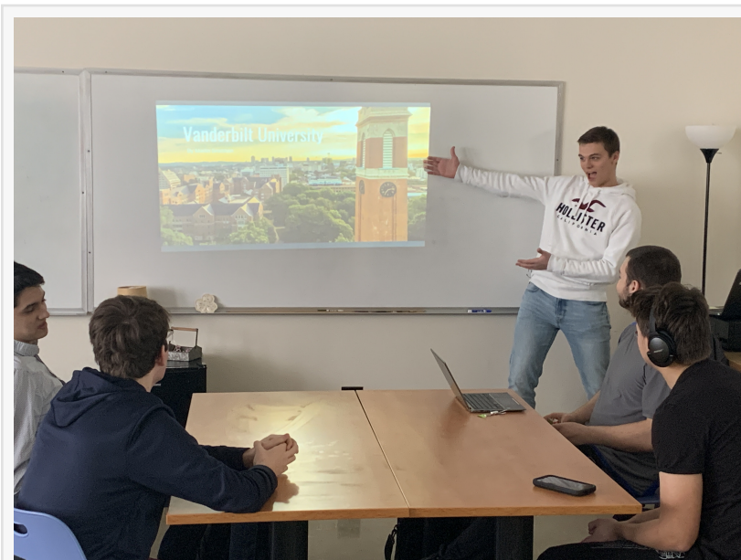
A junior happily shows a college he researched for junior seminar.

One of the unique aspects of MSSM's college counseling approach is the emphasis on finding a college that is the best fit for each student. This requires more than just looking at rankings or prestige; it involves helping students reflect on their personal goals, academic interests, and what they hope