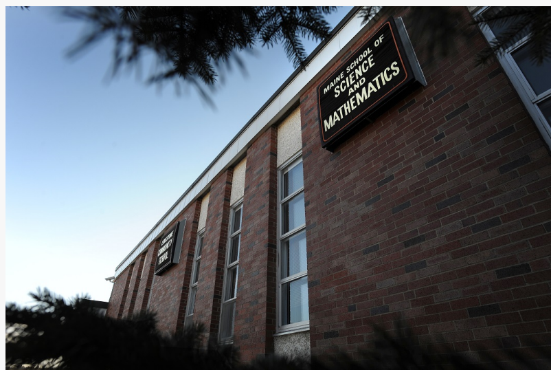
The outside of Maine School of Science and Mathematics.