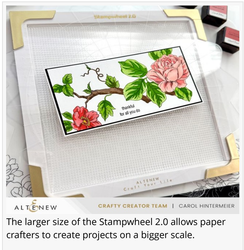
The larger size of the Stampwheel 2.0 allows paper crafters to create projects on a bigger scale.