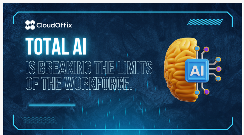
CloudOffix Total AI