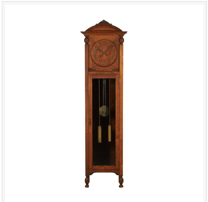
Canadian Pequegnat "Nelson" Hall clock with a quarter cut oak case, made during the Berlin period (1904-1916), considered the rarest of the Pequegnat Hall clocks (est. CA$3,500-$5,000).

A 1950s Japanese-made Packard Patrician toy car, made by ALPS, considered one of the quality Japanese toy makers, has an estimate of $1,200-$1,500. The 16 ½ inch vehicle, marked "ALPS made in Japan, is tested and working, even retaining the original hood ornament. The Packard Patrician was more prestigious than the regular Packard. It was built for the upper class, the elites, as a way for Packard to keep pace with luxury auto makers like Cadillac and Lincoln.