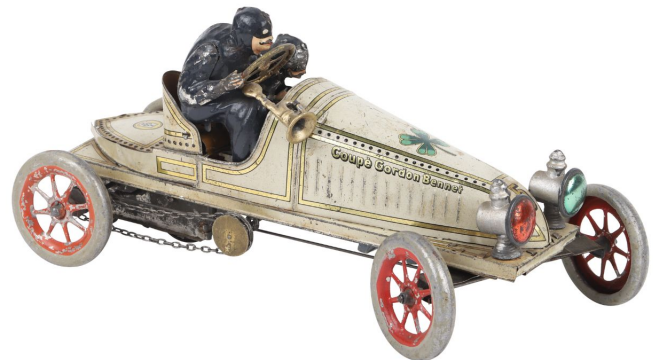
Circa 1905-1910 lithographed tin toy depicting a Coupe Gordon Bennet No. 5 race car made by Siegfried Gunthermann Adolf Weigel, in very good original condition (est. CA$8,000-$10,000).

Many of the higher-dollar lots can be found in the November 9th session. These will be led by an