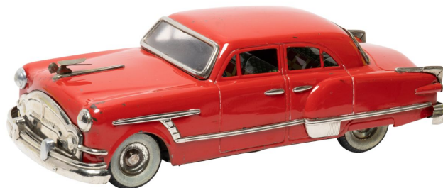
1950s Japanese-made Packard Patrician toy car, made by ALPS, considered one of the quality Japanese toy makers, tested and working, with original hood ornament (est. CA$1,200-$1,500).

To consign a single piece, an estate or a collection, you may call them at (519) 573-3710; or, you can e-mail them at info@millerandmillerauctions.com . To learn more about Miller & Miller Auctions, Ltd. and the auctions on November 8th & 9th, visit www.millerandmillerauctions.com .