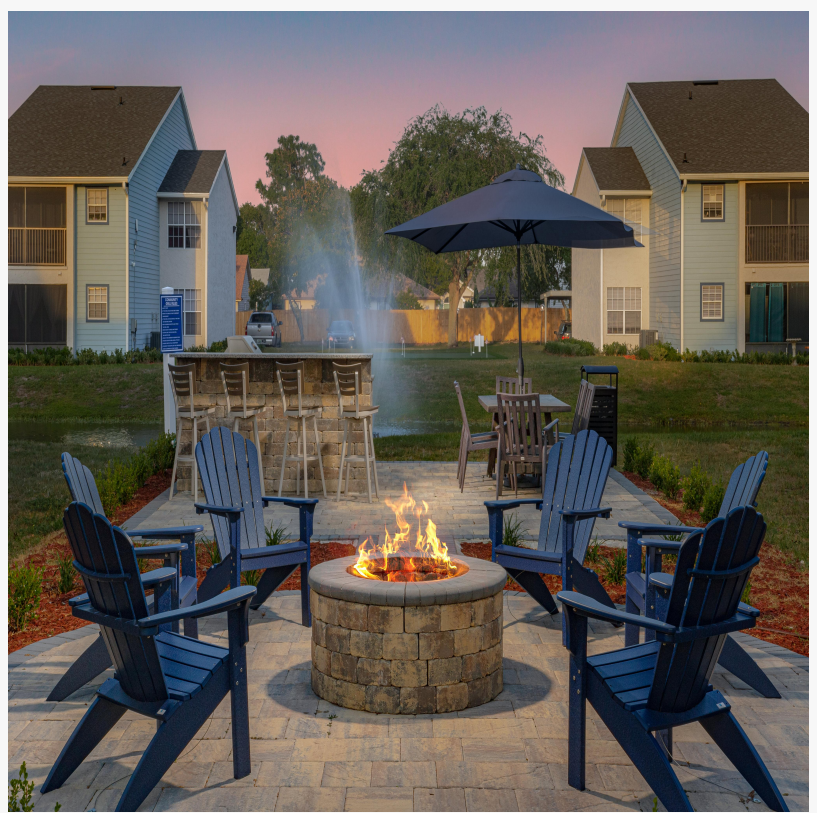
Portofino Club offers an outdoor fire pit with seating, a bar area, and scenic views, along with other great amenities.

ATX Acquisitions was founded in 2021 by the owner of Avesta Real Estate Holdings, LLC (also known as InvestRes) and industry leaders with deep experience in multifamily real estate investment and management to pursue long-term hold, opportunistic, real estate investments. ATX Acquisitions specializes in the acquisition properties that are well positioned to benefit from three key marketing forces: technological innovation, high growth markets, high and persistent inflation.