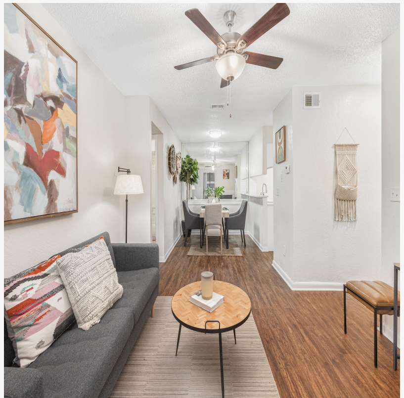
Open-concept layout featuring a cozy living room that flows into the dining area and kitchen.