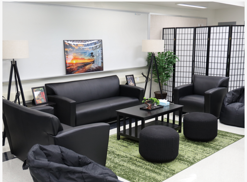
A Wellness Room at a Glendale Unified High School

2022 = The 50th Anniversary of Tarzana Treatment Centers