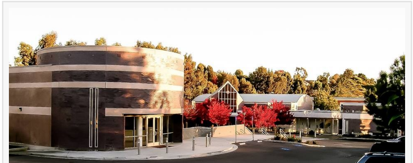
CIHS campus in Encinitas, California