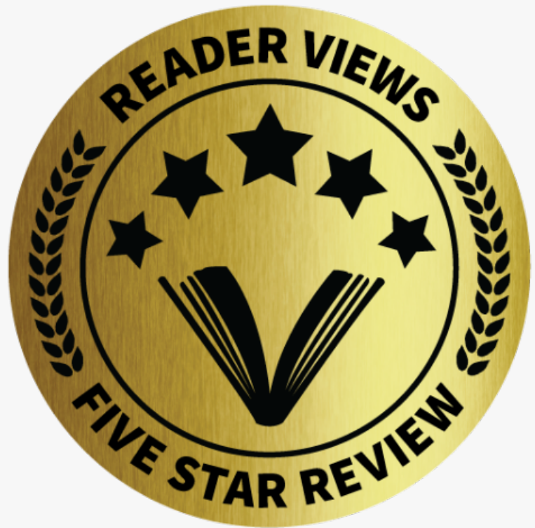
Five Star Accolades