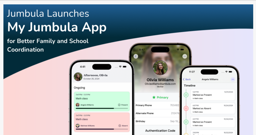
Jumbula launches My Jumbula app for seamless family-school coordination.

- Daily Dashboard: Start each day with a clear overview of your children's schedule and attendance. You can see if they are checked in or out and get all the details for upcoming events