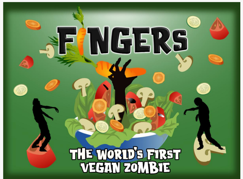
"Fingers - The World's First Vegan Zombie" - short film by Belton Mouras Jr. Entertainment

CA, UNITED STATES, October 30, 2024 /EINPresswire.com/ -- Families feast on laughter with instant cult classic; Fingers: The World's First Vegan Zombie! This wildly original new short film flips the zombie genre on its head, serving up a hilarious and unforgettable adventure that's resonating with movie-lovers of all ages. Join a quirky crew of zombies as they battle it out between two factions: recovering zombies determined to convert their meat-loving counterparts to the veggie-loving ZIT Program (Zombies in Transition).