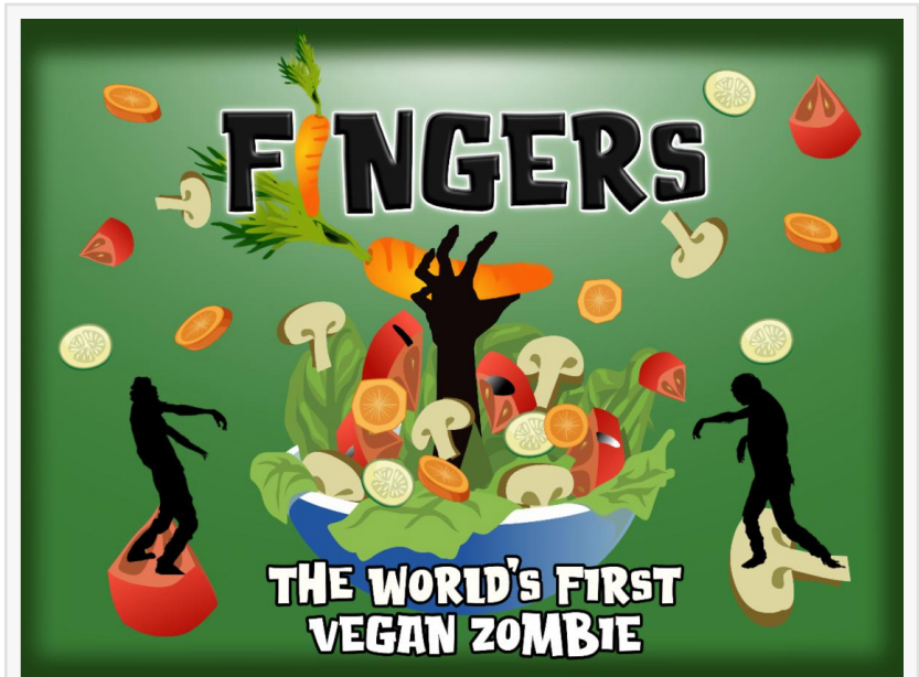
"Fingers - The World's First Vegan Zombie" - short film by Belton Mouras Jr. Entertainment