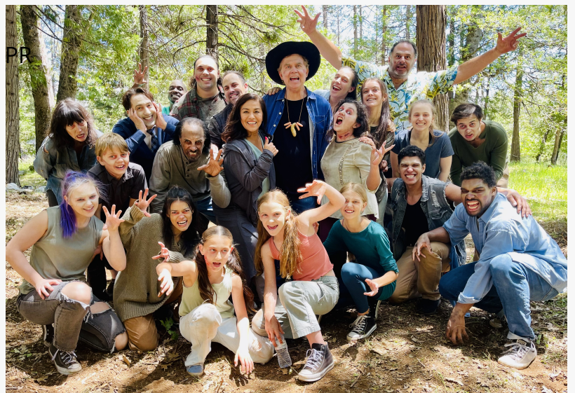
Zombies from "Fingers - The World's First Vegan Zombie" and "Step Step Step"- Belton Mouras Jr. Entertainment

Rive Video Rive Music Video Distribution, Promotion, PR +1 908-601-1409 email us here Visit us on social media: Facebook X LinkedIn Instagram YouTube