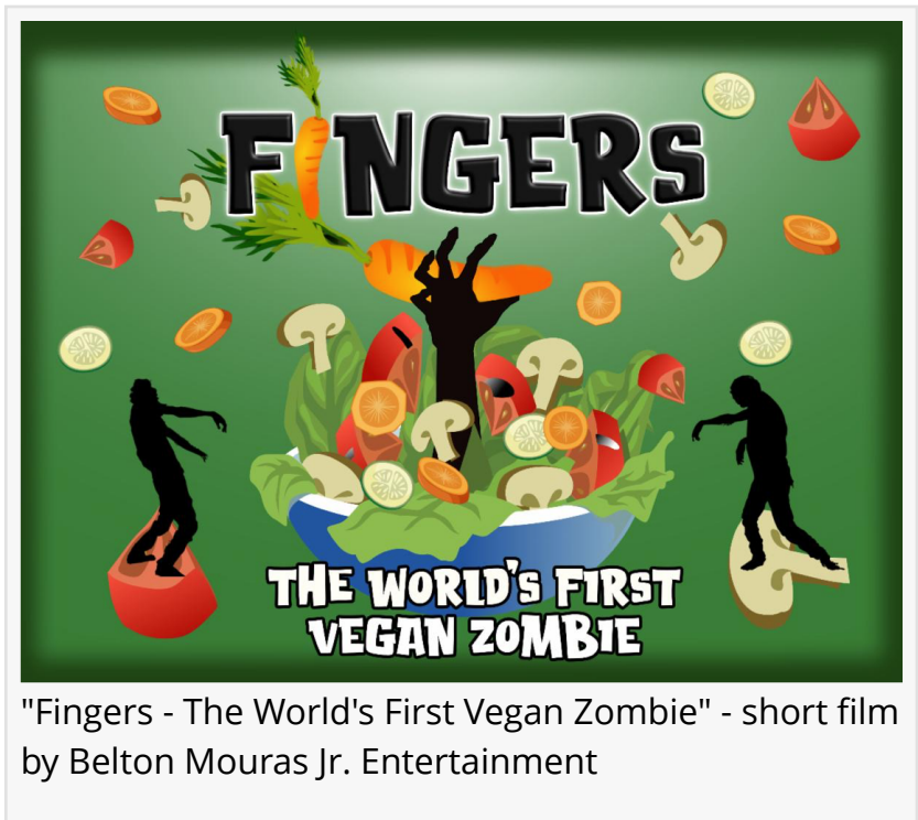
"Fingers - The World's First Vegan Zombie" - short film by Belton Mouras Jr. Entertainment

His latest film, Fingers: The World's First Vegan Zombie, debuted in October 2024 at the Sacramento IMAX theater. Belton Mouras Entertainment proudly announces its online release, now available for worldwide viewing on YouTube.