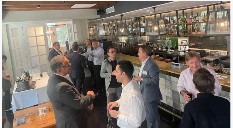
MSP Partner Assurance Program