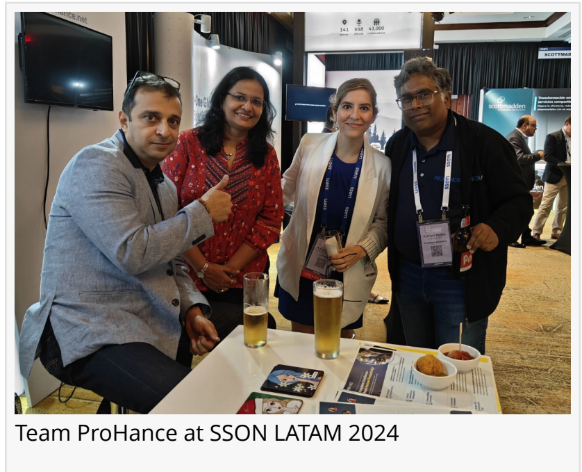
Team ProHance at SSON LATAM 2024

SSON LATAM, renowned for fostering insights into the latest trends and solutions in shared services and outsourcing, provided ProHance a platform to engage with industry leaders, discuss key challenges, and present innovative solutions that drive efficiency across business functions. ProHance's team highlighted the platform's role in enabling organizations to enhance performance, support compliance, reduce operational costs, and adapt seamlessly to evolving business landscapes.