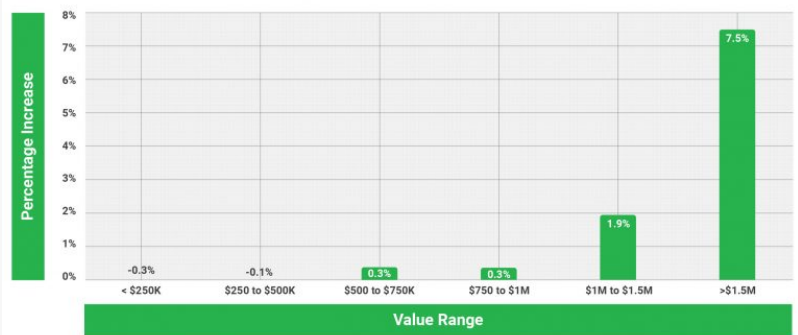
2024 Residential Increase by Value Range