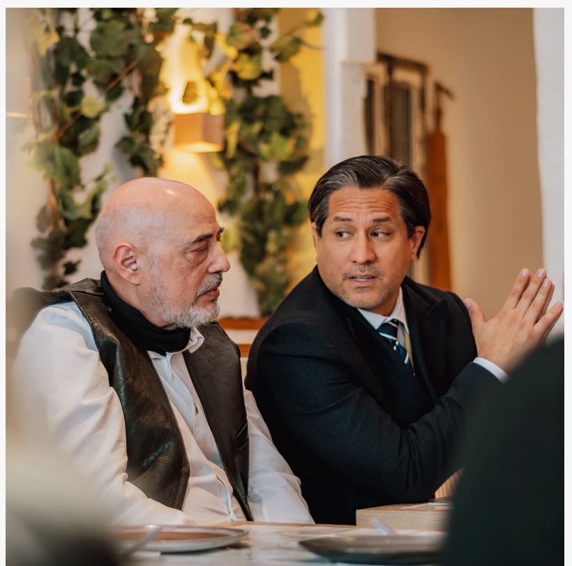
Soriano Motori is an innovative lifestyle company.

The collaboration is expected to not only boost sales but also enhance brand recognition and customer loyalty, setting a new standard in the electric vehicle market.