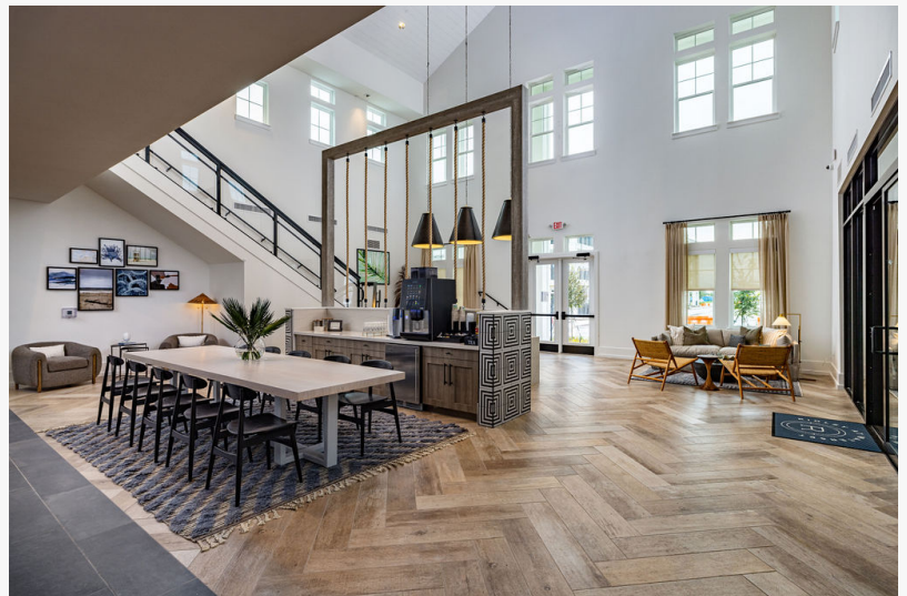
The spacious clubhouse is one of several exceptional amenities designed for comfort and community.