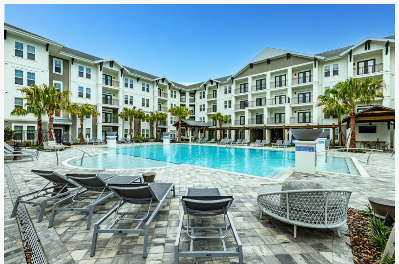
The property boasts an inviting swimming pool, offering a perfect spot to relax and unwind.

"We are incredibly excited to add The Ridley at Waterset to our growing Gulf-region portfolio. We look forward to serving the residents of Apollo Beach with the highest level of care and service. We are deeply grateful to Woodfield Development for entrusting us with this exceptional property, and we're eager to build a strong, lasting partnership with them. The Ridley at Waterset represents the best of what ResProp stands for,