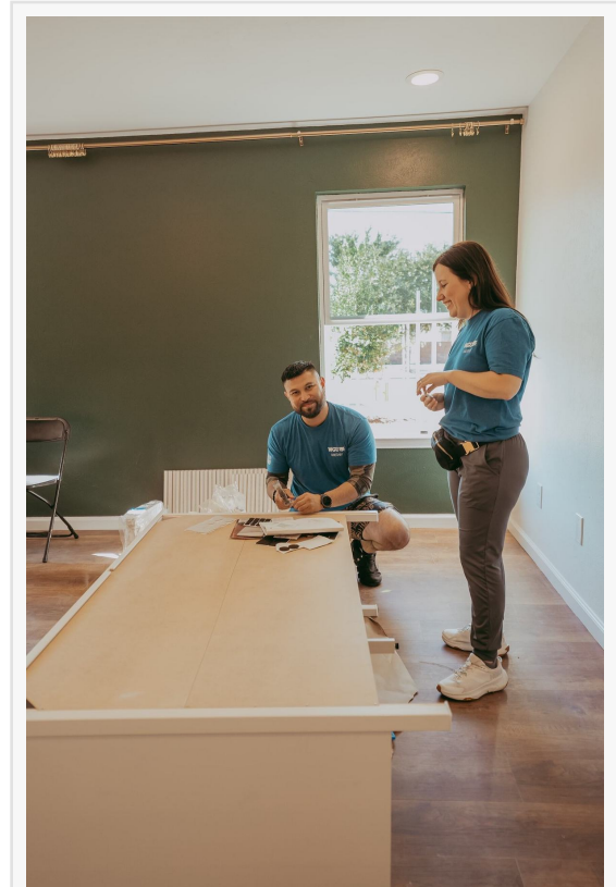
WGU Volunteers Working on Finishing Touches