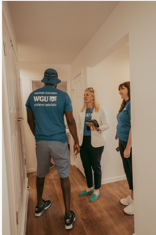
WGU Volunteers Meeting