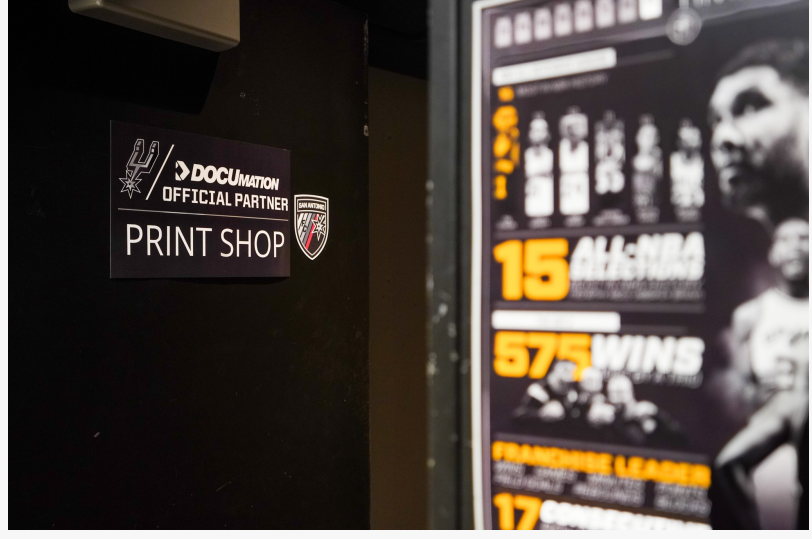
DOCUmation's Print Shop at the Frost Bank Center