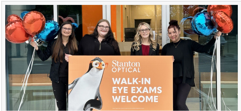
Stanton Optical Lexington Staff Celebrating Grand Opening Ceremony

LEXINGTON, SC, UNITED STATES, November 1, 2024 /EINPresswire.com/ -- Stanton Optical, a pioneer in affordable and accessible eye care, announces the grand opening of its latest store in 5580 Sunset Blvd, Suite C-1, Lexington, SC 29072, strengthens Stanton Optical's commitment to delivering on its mission of Making Eye Care Easy across 280+ locations nationwide.