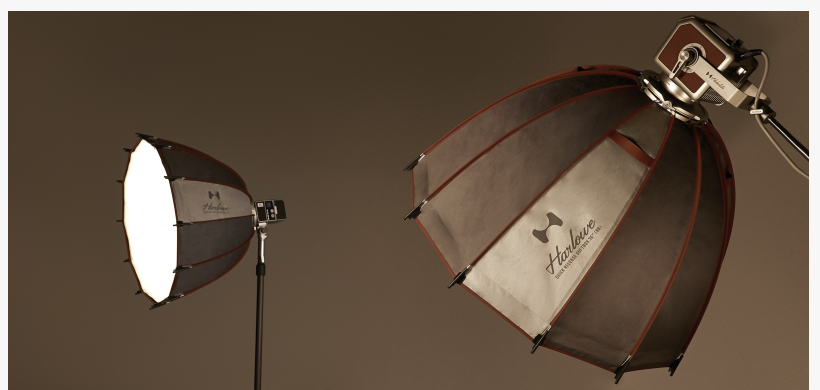
Quick Release Softbox 24"

The Blade Series, Quick Release Softbox 24", and GOBO Optical Light Lens are now available for purchase on the Harlowe website at www.harlowe.com and through authorized retailers.