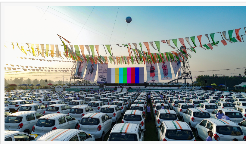
As part of its annual Diwali tradition, Hari Krishna Exports gifts its employees with cars, flats, and jewelry, symbolising its commitment to employee welfare and appreciation.

Hari Krishna Exports: Championing Sustainability