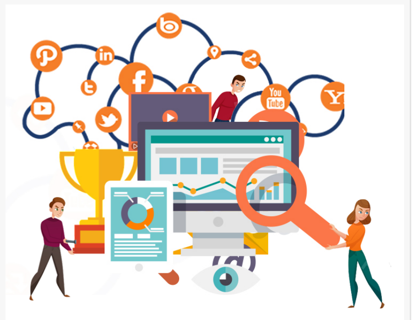
Negative Link Removal Company