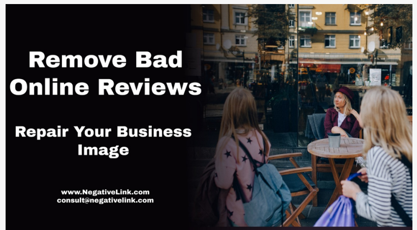
Bad link removal services

Complete Content Removal Services for All Needs