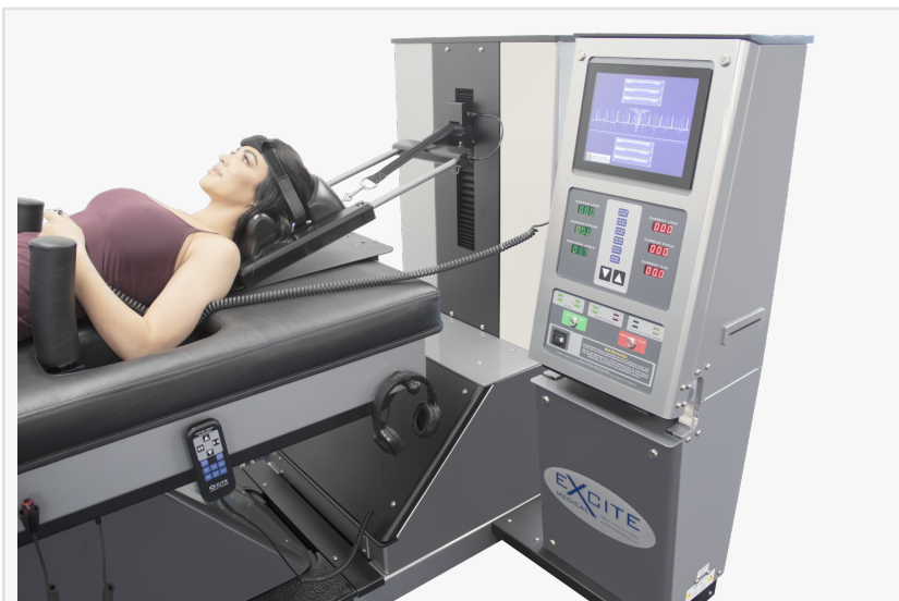
DRX9000C Cervical Spinal Decompression Machine w/ Patient