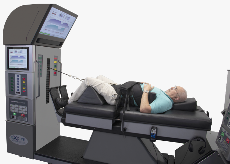
Geriatric male patient being treated on lumbar portion of DRX9000 Spinal Decompression Table. The DRX9000 Spinal Decompression Device that this patient also has the ability of treating the cervical region.