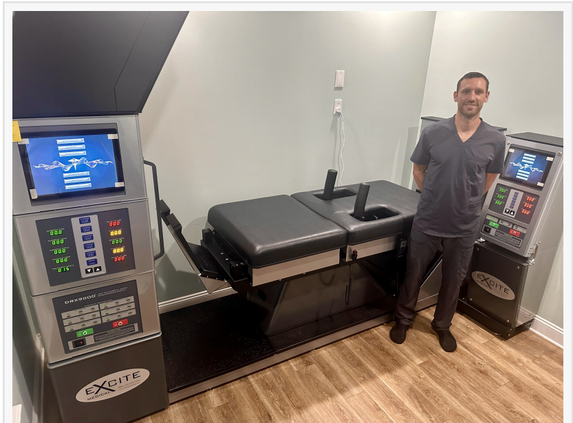
DRX9000 Spinal Decompression Table at Dr. Derek Sisak Spinal Solution Clinic in St Augustine FL