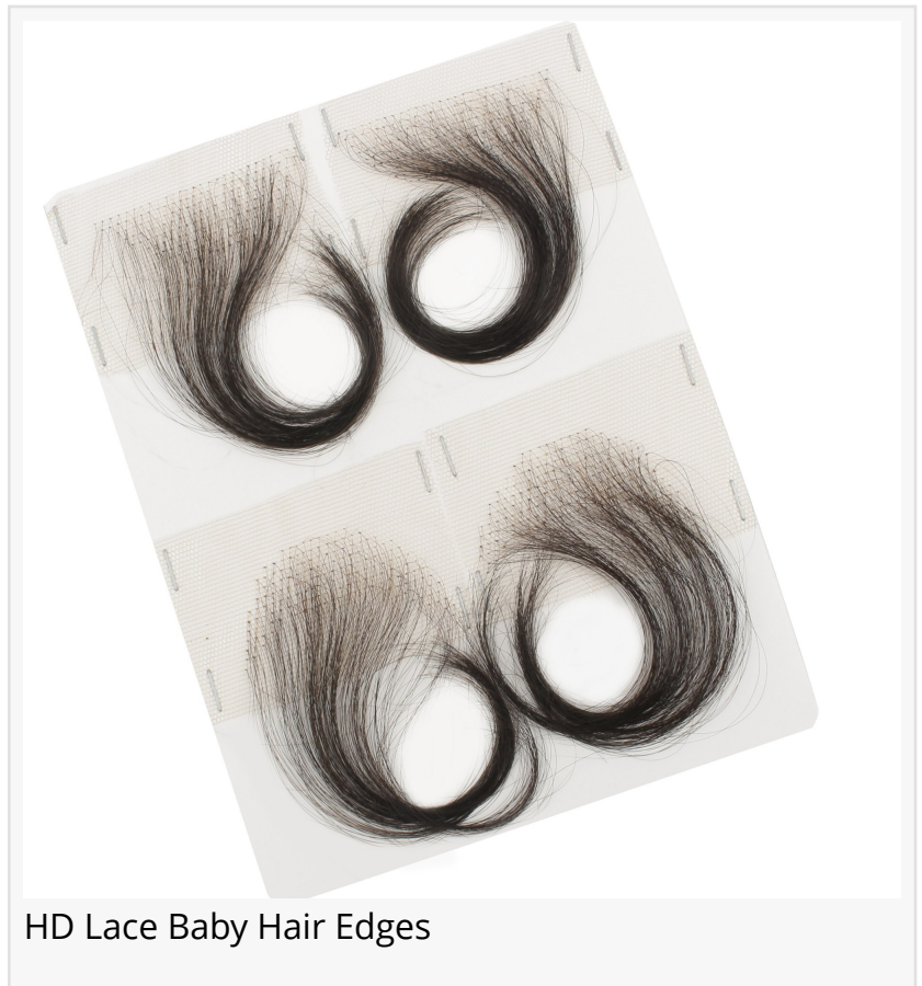
HD Lace Baby Hair Edges

This press release can be viewed online at: https://www.einpresswire.com/article/755857524