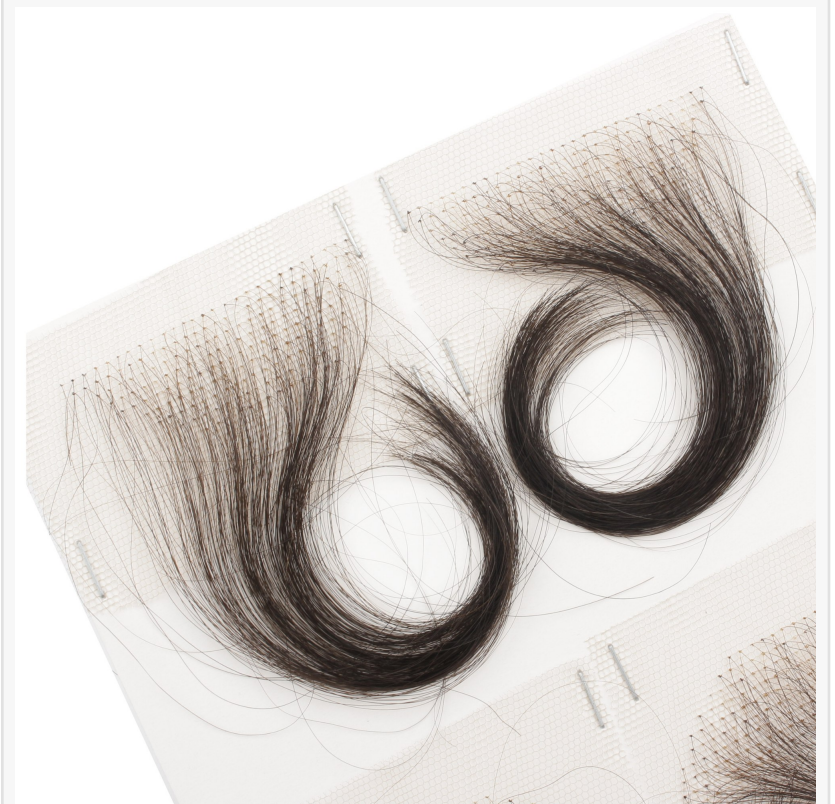
I-Stripe Baby Hair Edges