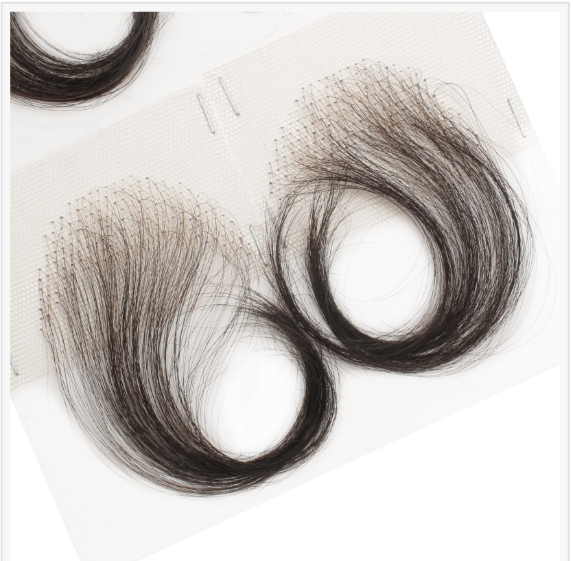
V-Stripe Baby Hair Edges