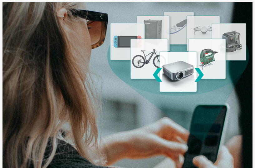
Beamer, camera equipment or tools | everything can be shared with 2-SHARE by fainin