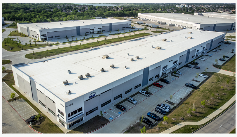
Aerial photo of the ELM MicroGrid

nongovernmental organizations from many countries. The ISO 9001 standard is utilized to certify quality management systems that focus on continuous improvement, customer satisfaction and the active involvement of both management and employees in a process-based approach.