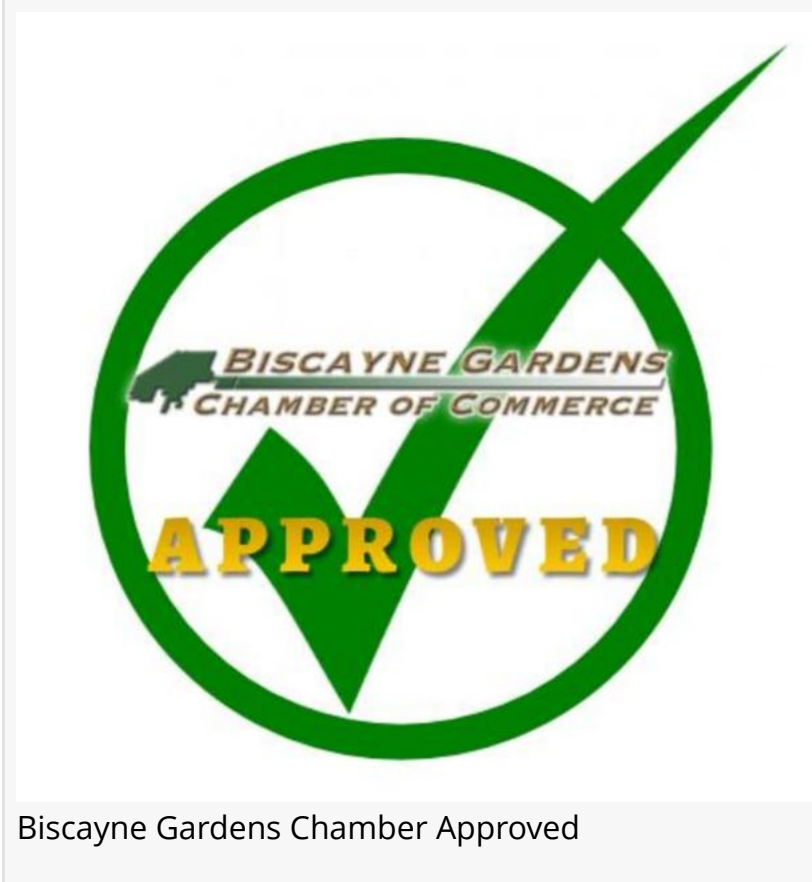
Biscayne Gardens Chamber Approved

This press release can be viewed online at: https://www.einpresswire.com/article/756001193