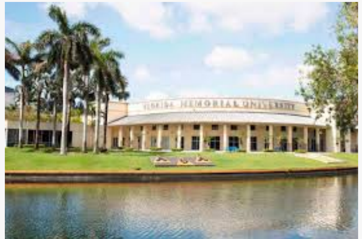
FMU a Promise, A Furture