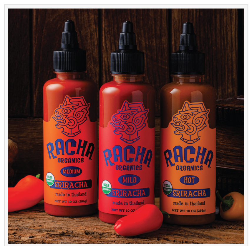
Racha Organics debut product, the Racha Sriracha sauce line, brings authentic Thai flavors to consumers. Racha sauces are crafted with one-of-a-kind, USDA-certified organic Racha peppers cultivated exclusively on their organic farm in northern Thailand.

We are a team of Thai and American sauce lovers, united by our dedication to organic farming