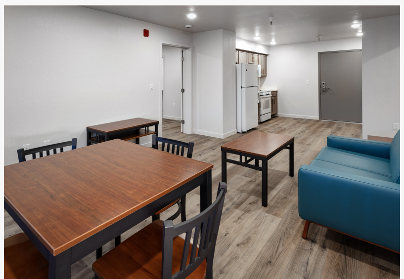
Inside one of the new apartments

The driving factor of Heartwood’s success was Jamboree’s partnership and meticulous teamwork with Santa Clara County and the City of Mountain View.