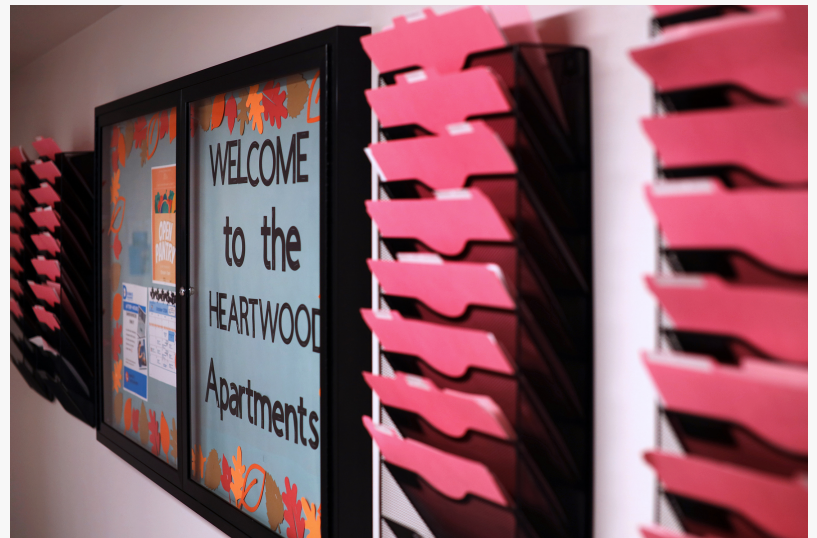
"Welcome to the Heartwood Apartments" sign greets new residents