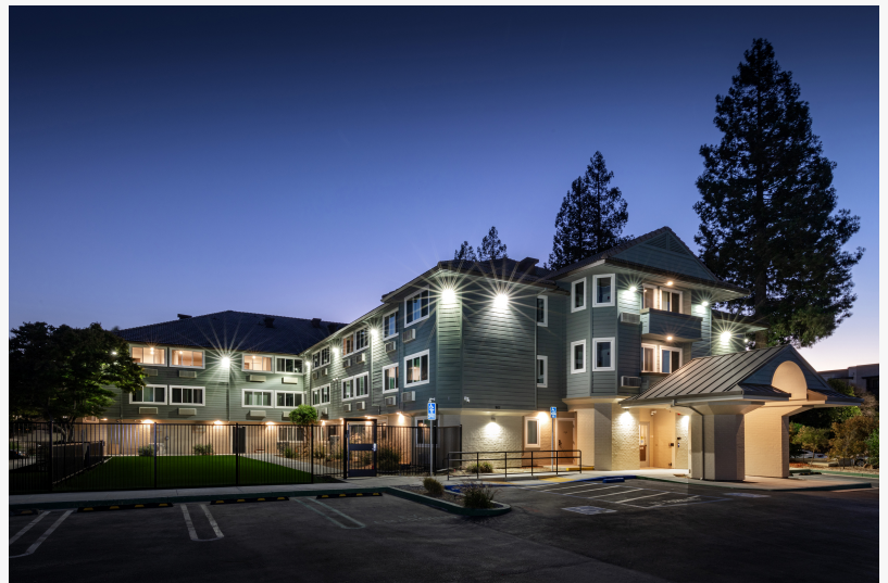
A view from the front of The Heartwood Apartments

SAN JOSE, CA, UNITED STATES, October 30, 2024 /EINPresswire.com/ -- The County of Santa Clara, the City of Mountain View, and nonprofit affordable housing developer Jamboree Housing Corporation are opening the doors today to The Heartwood Apartments (Heartwood), an affordable housing community accommodating 48 individuals experiencing homelessness. Formerly The Crestview hotel, Heartwood was the first hotel converted into an affordable housing community in Mountain View.