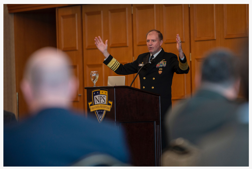
U.S. Navy Adm. Stuart B. Munsch, Commander, U.S. Naval Forces Europe Commander, addressed NPS international alumni.