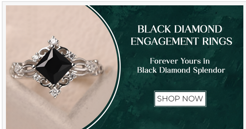
black diamonds ring

In a world where colorless diamonds have dominated the luxury jewelry market, Gemone Diamonds presents a sophisticated alternative: natural black diamonds. Known for their unique allure and powerful symbolism, black diamonds embody strength, simplicity, and a refined class all their own. While traditional diamonds have been long cherished for their brilliance, black