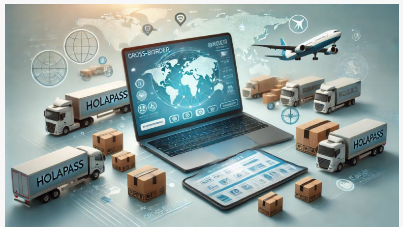
Holapass Aims to Transform Global E-Commerce with Cross-Border Solutions