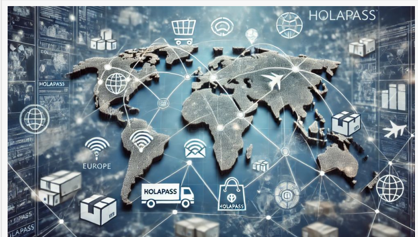
Holapass Aims to Transform Global E-Commerce with Cross-Border Solutions

For international buyers, Holapass promises an efficient and reliable experience. The platform caters to individual consumers and small- to medium-sized enterprises (SMEs), providing access to China's vast marketplace. Through services such as procurement and international logistics,