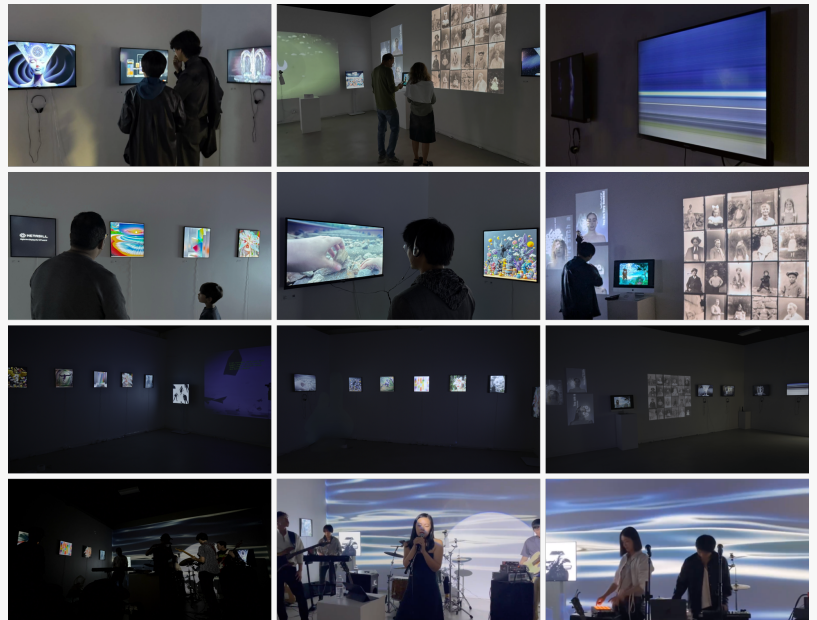
ArtX Gallery Digital Impressions - Silicon Valley International Digital Art Exhibition