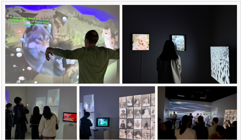
ArtX Gallery Digital Impressions - Silicon Valley International Digital Art Exhibit

to create contemporary expressions of our time. It's not just about the visual spectacle—Digital Impressions explores how technology is influencing our emotions, relationships, and the way we see the world. In the same way Impressionism redefined traditional art, this exhibition speaks to the profound changes happening in art today as we dive deeper into the digital revolution.