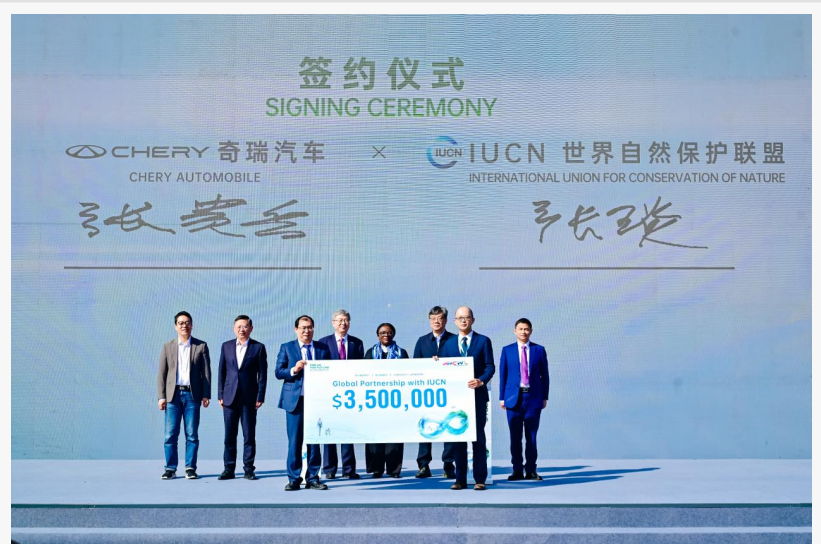
Pictured: Signing ceremony for Chery and IUCN global partnership.

Collaborating for Green Development With growing global awareness of environmental protection, more companies are recognizing their social responsibility and actively participating in environmental initiatives. As a leading player in the Chinese automotive industry, Chery has long been committed to promoting environmental sustainability. This collaboration with IUCN represents another significant step forward in Chery's efforts to contribute to environmental conservation.