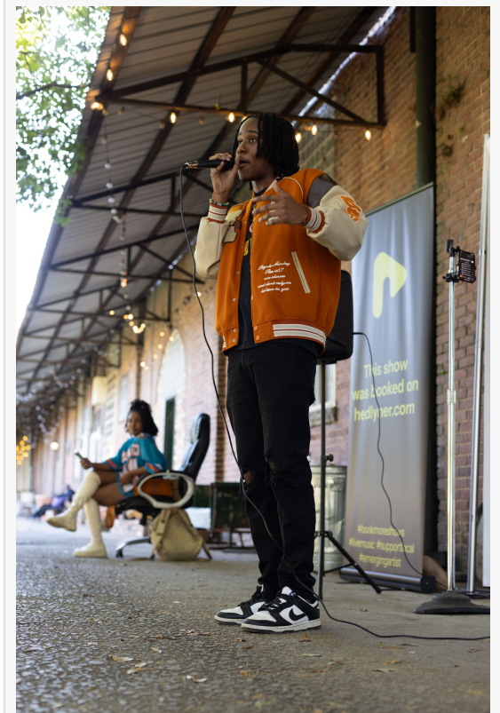
National CEG (NCEG) x Hedlyner