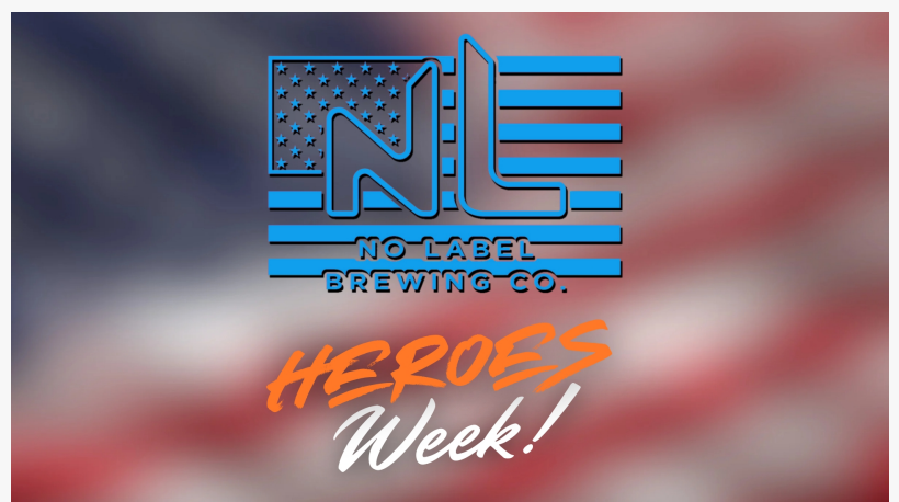
Heroes Week at No Label

During the entire eight-day celebration, veterans, teachers, and first responders will be able to enjoy a second beer free and half-off on to-go beer. This offer is available every day from November 4th through Veterans Day on November 11th, making Heroes Week the perfect time to visit No Label