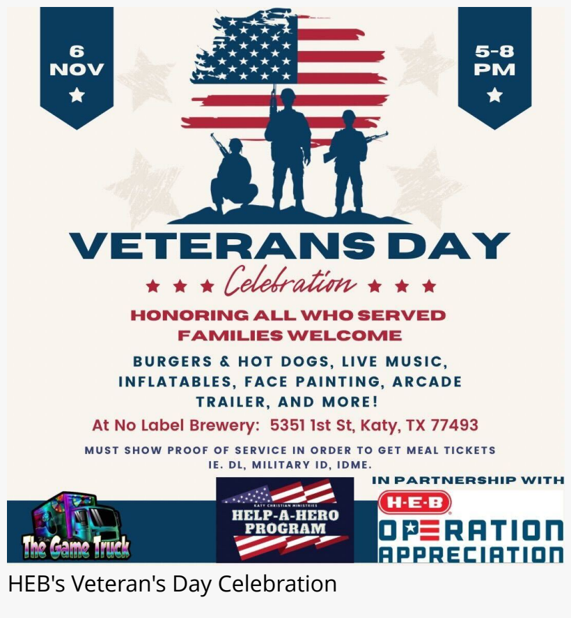
HEB's Veteran's Day Celebration