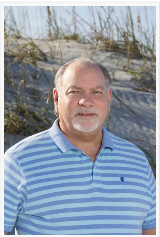
"All of us are made in the image of God..."