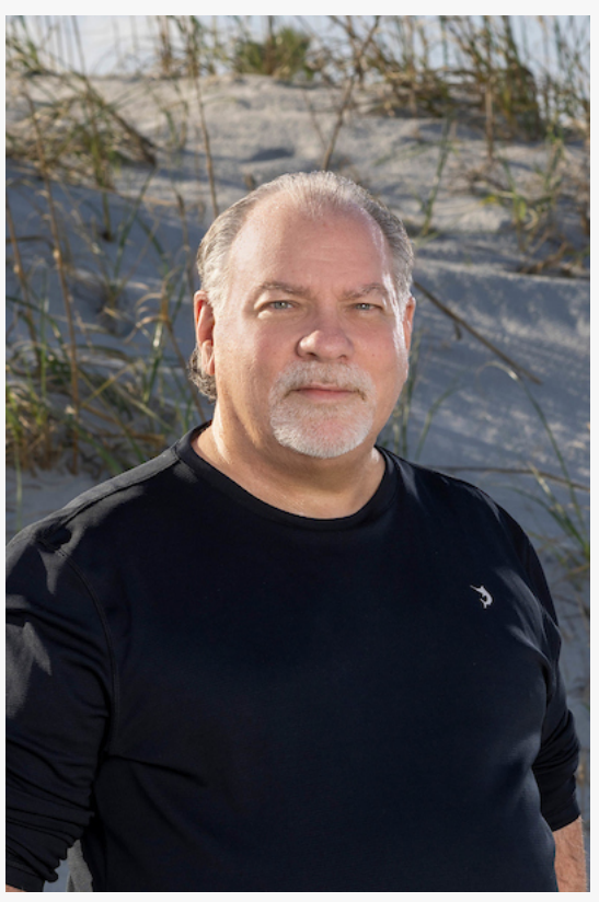
"Be strong in the Lord and in his mighty power (Eph 6:10)"