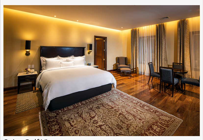
Suite Golf View