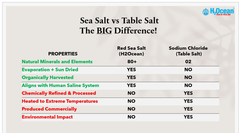
Difference between Red Sea Salt and Table Salt

At H2Ocean, we are driven by a mission to help cancer patients and survivors manage their oral side effects and improve their quality of life. We invite healthcare professionals, cancer