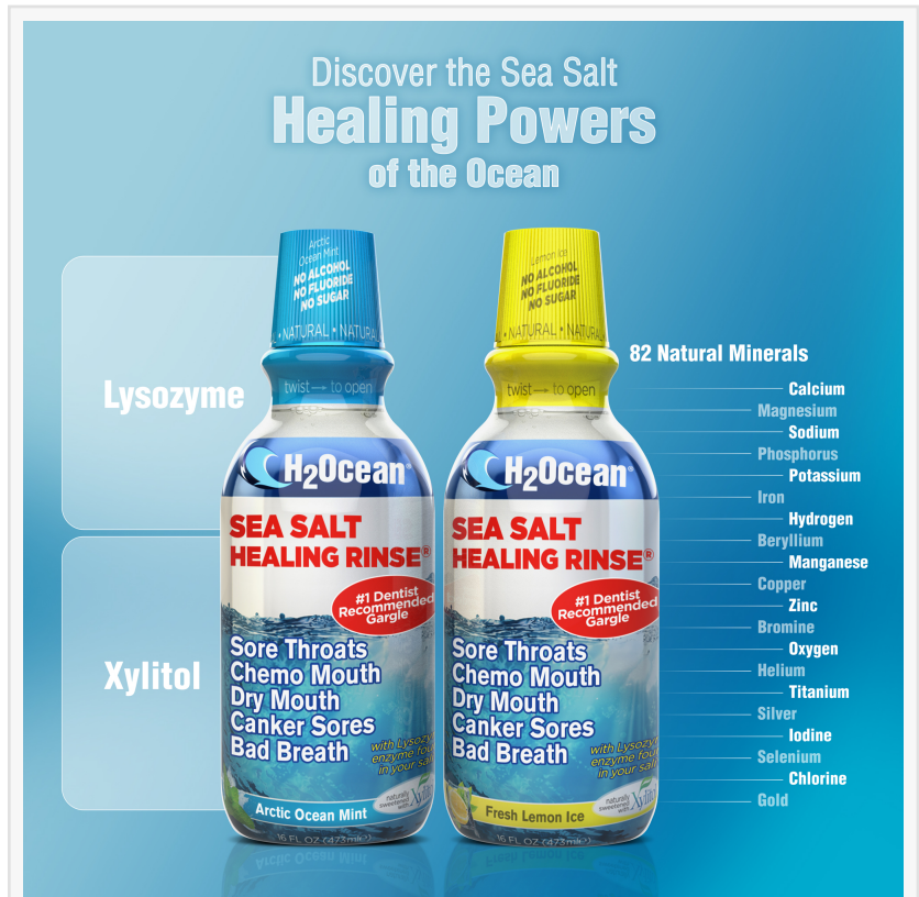
H2Ocean Healing Rinse Sea Salt Mouthwash

H2Ocean's commitment extends beyond product development. The company proudly partners with cancer organizations, hospitals, and non-governmental organizations (NGOs) to provide free samples of its Healing Rinse to cancer patients and survivors who need it most. These donations aim to improve the daily lives of patients suffering from oral side effects, making their survivorship journey more manageable.