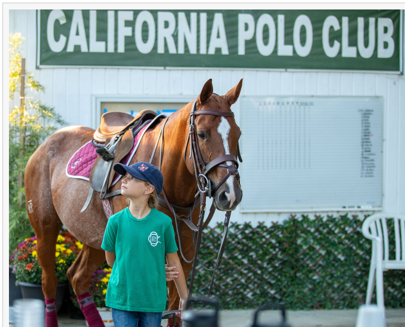
A young arena polo fan holds a horse ready for the next chukker

“Being a part of PCAL this year was super fun. Got to meet some amazing people, see old friends, and play great arena polo. I love all the awards and recognition for our playing abilities